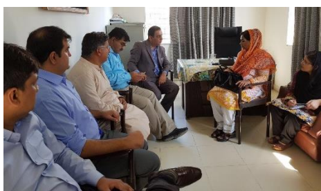
Site visit to Karachi Central on October 05, 2017

Kick off meeting with PWD and LHW Program was held on October 5, 2017, at PWD office, Karachi. This was followed by site visit to Karachi Central, Lady Health Supervisor (LHS) stores for determining the storage capacity for holding the quantum of supplies both on quarterly and bi-annual basis. Based on meeting discussions, PSM team worked on draft distribution plans for LHW Program, proposing six options with cost implications, which were then presented to the senior officials of PWD and LHW Program on October 9, 2017, at Marriot Hotel, Karachi. ( Annexure-1: List of Participants )