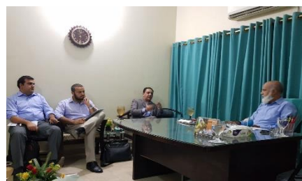
Meeting on October 05, 2017 - Karachi