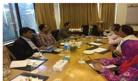
Meeting on October 09, 2017 - Karachi